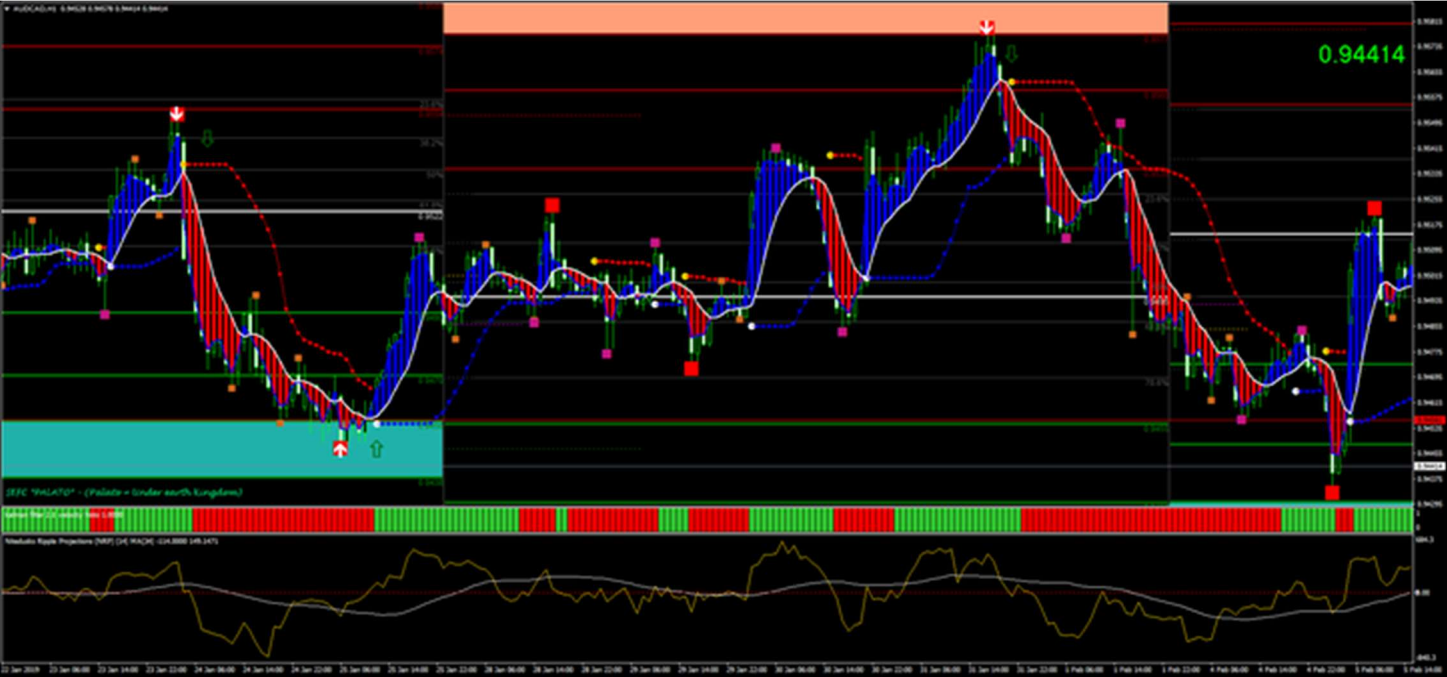
Projections Future stable version