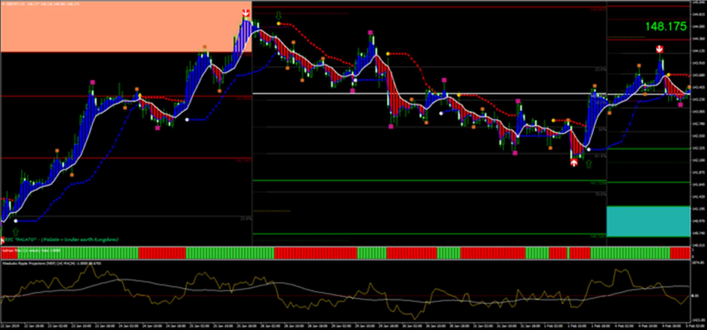
Projections Future stable version